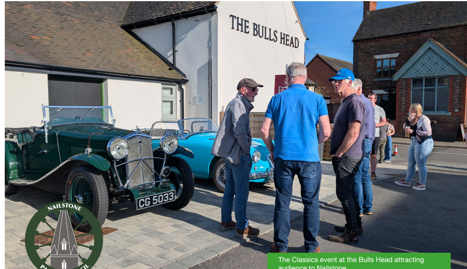
The Classics event at the Bulls Head attracting audience to Nailstone