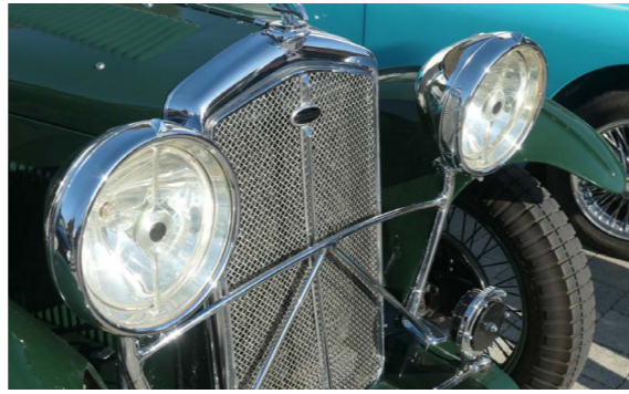
1933 Wolseley Hornet Special

The next Classics at The Bull's Head will take place on the first Tuesday of each month, with the next meet on Tuesday 2nd June.