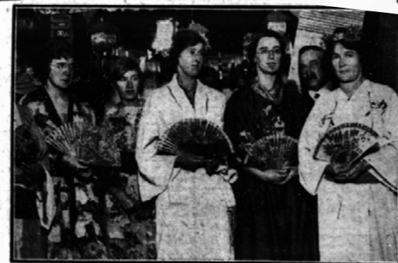
PICTURESQUE JAPANESE ROBES were worn by the party of workers at the bazaar held in aid of the lighting fund of Nailstone Church.

NAILSTONE CHURCH. The Bishop of Leicester is to preach at Nailstone Church next Sunday evening, when the church will be lighted with electricity for the first time.