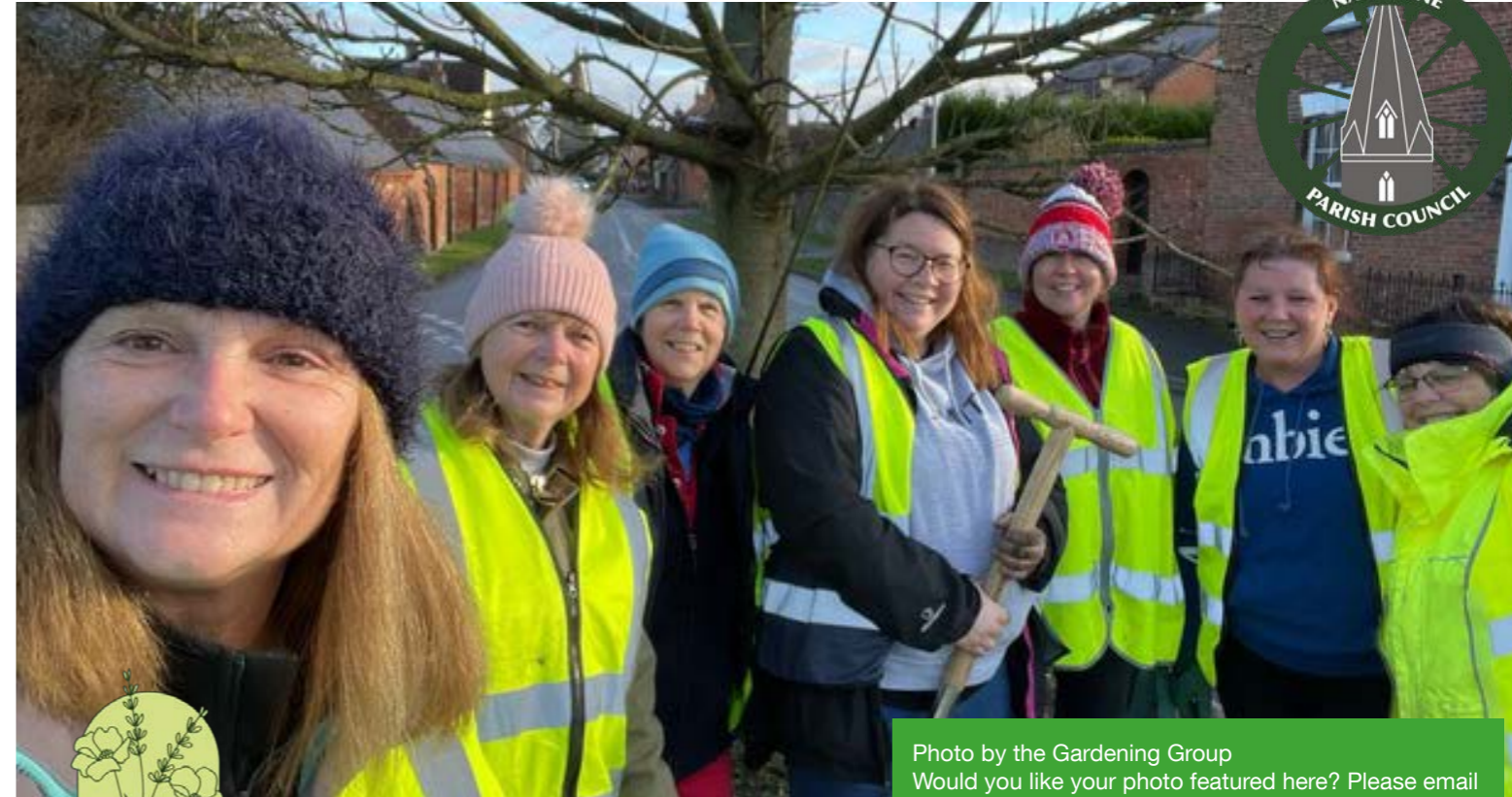
Would you like your photo featured here? Please email it to clldarlington@nailstoneparishcouncil.org.uk