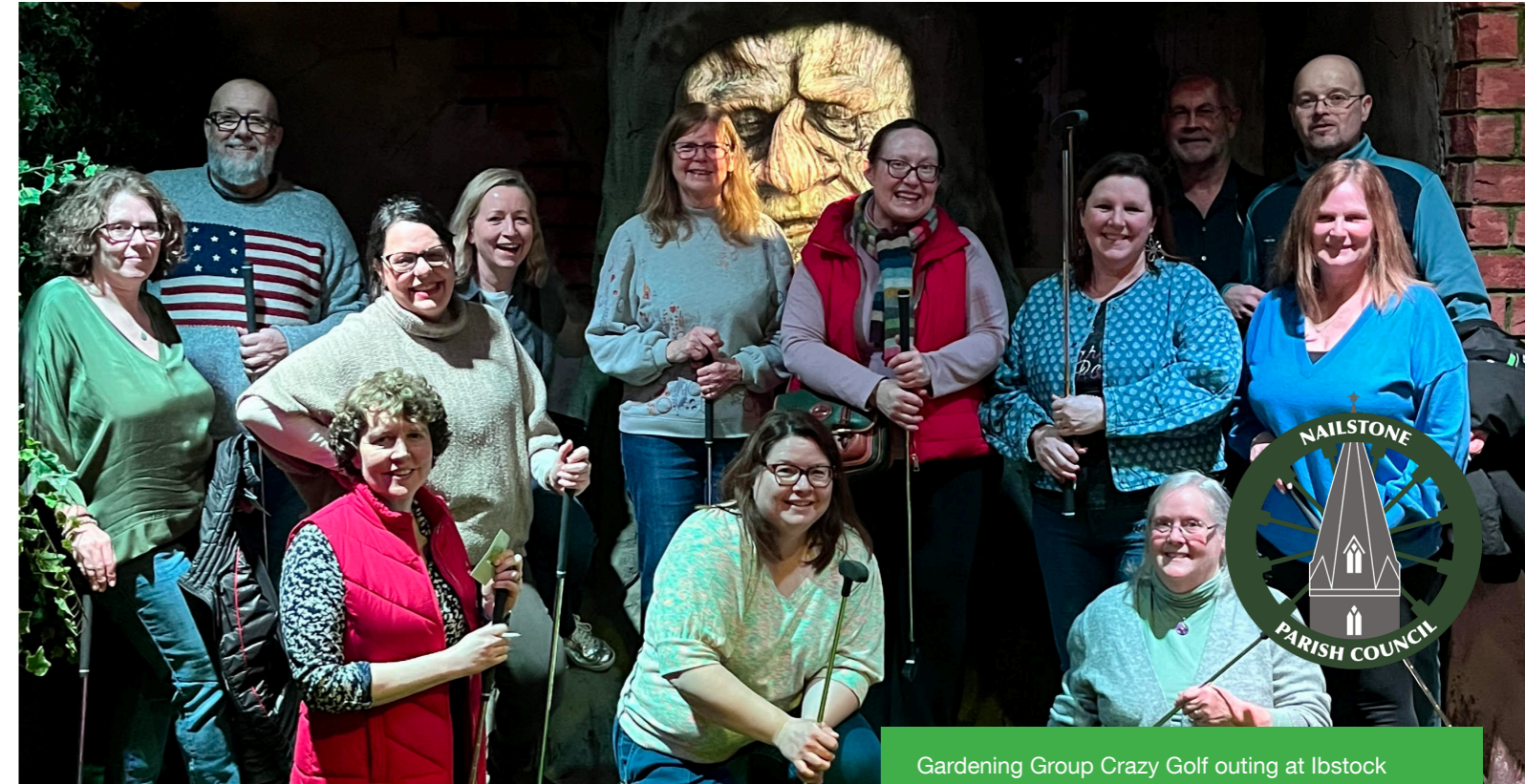
Gardening Group Crazy Golf outing at Ibstock